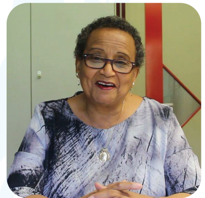
MRS LALLA BEN BARKA KEYNOTE SPEAKER, 2022 COMMENCEMENT

THE UNIVERSITY FOR PEACE (UN MANDATED) WAS ESTABLISHED IN DECEMBER 1980 THROUGH UNITED NATIONS GENERAL ASSEMBLY RESOLUTION 35/55 AS AN INTERNATIONAL HIGHER EDUCATION INSTITUTION FOR PEACE WITH HEADQUARTERS IN COSTA RICA. AS DETERMINED IN THE CHARTER OF THE UNIVERSITY, THE MISSION OF THE UNIVERSITY FOR PEACE IS: