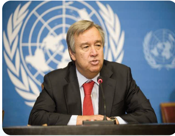
HE, ANTONIO GUTERRES, UNITED NATIONS SECRETARY GENERAL HONORARY PRESIDENT OF THE COUNCIL - UNIVERSITY FOR PEACE (UPEACE)